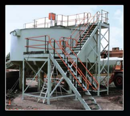
8m Thickener in operation