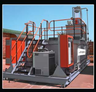
Skid mounted Flocculant Plant