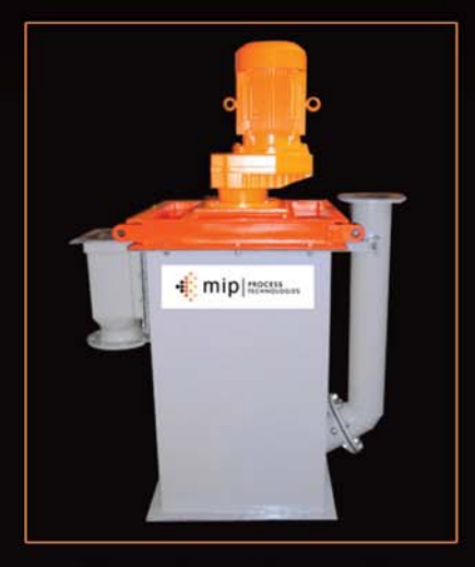
Pilot scale attrition scrubber