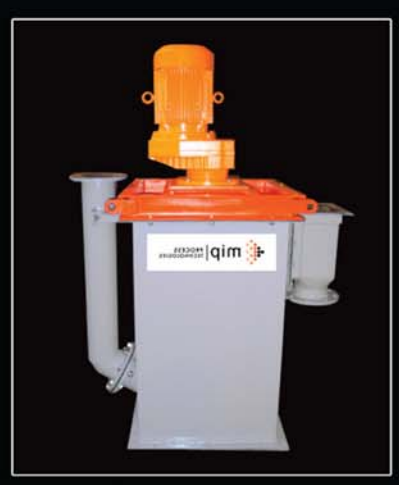
1m3 Attrition Scrubber