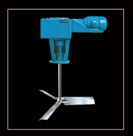
Chemineer HT Agitator